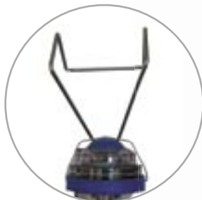
DeLaval milk meter MM6 with carrier hook