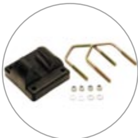
Fixed mount bracket

The unique lever to activate stirring in the meter is easily accessible from the pit area.