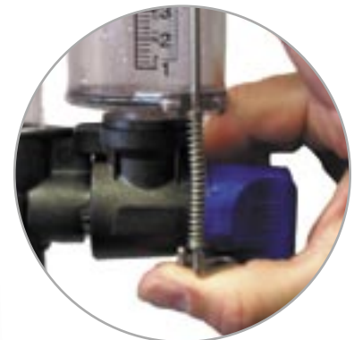
Sampling made easy with the DeLaval milk meter MM6