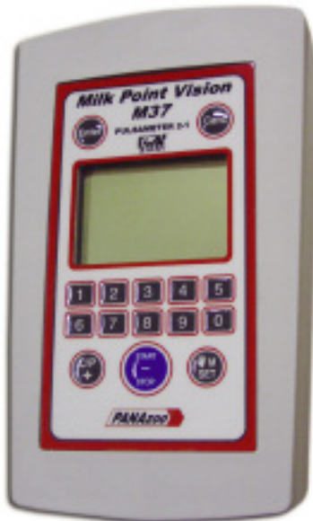
60037 - M37 MILK METER

60037F SWING OVER without washing valve and feed IN PARLOR