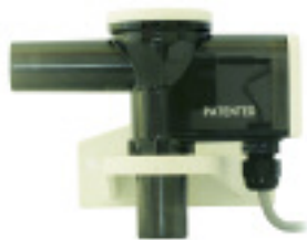
60090 Temperature and Conductivity Sensor