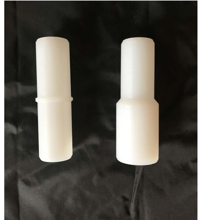
Mini-Cassia Dairy Testing (ID)

5/8 to 5/8 is $5.25 5/8 to 3/4 is $14.50