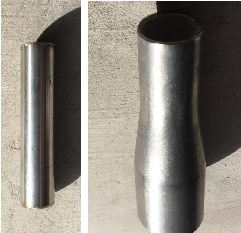
Vanden Bosch Testing (ID)

5/8 to 5/8 is $5.25 5/8 to 3/4 is $14.50